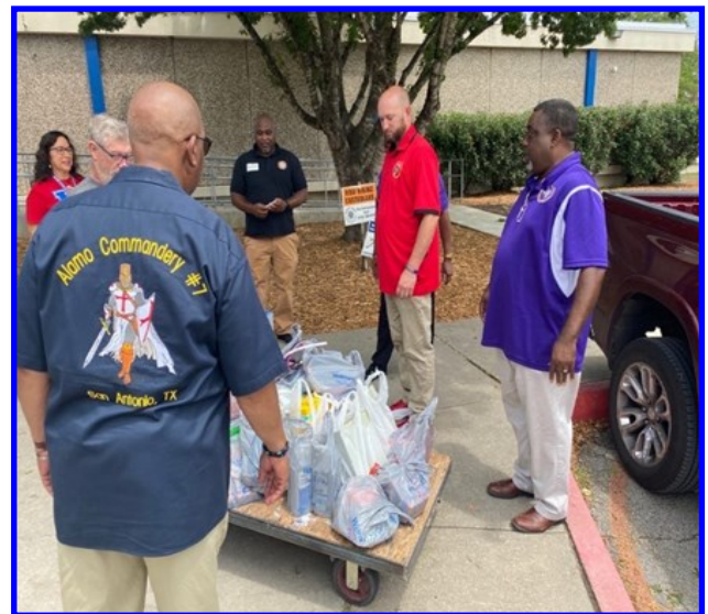
Members of 19th District York Rite Bodies unload several boxes and bags of school supplies for drop-off.