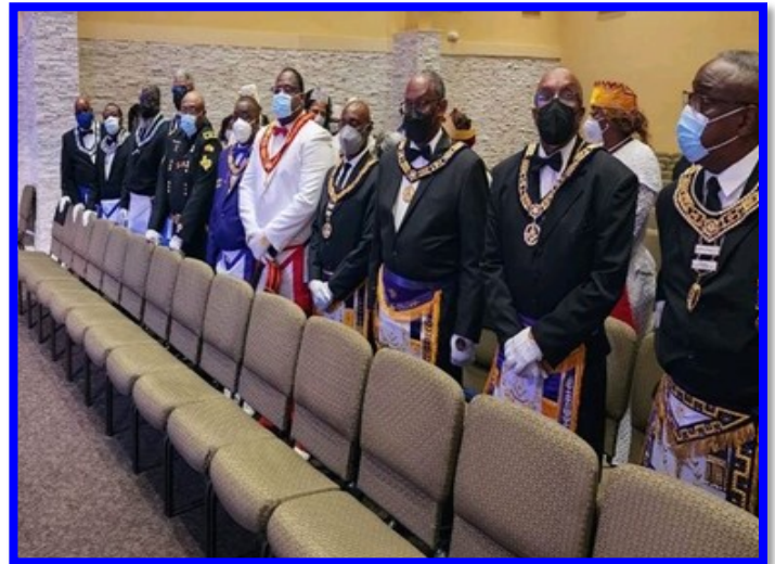
The Prince Hall Masonic Family of 19th District prepare for Sunday Devotion and Worship Service.