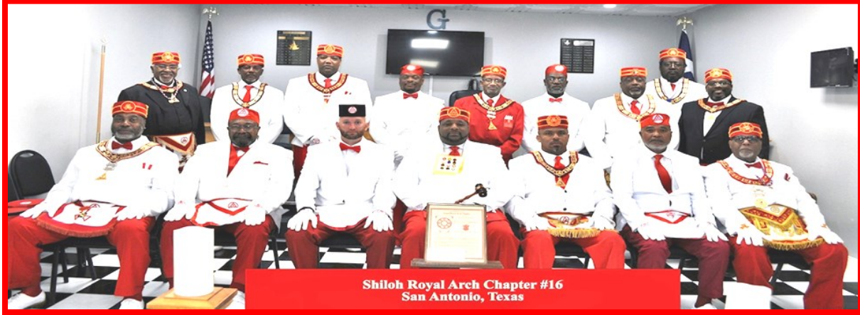
Shiloh Royal Arch Chapter #16 San Antonio, Texas