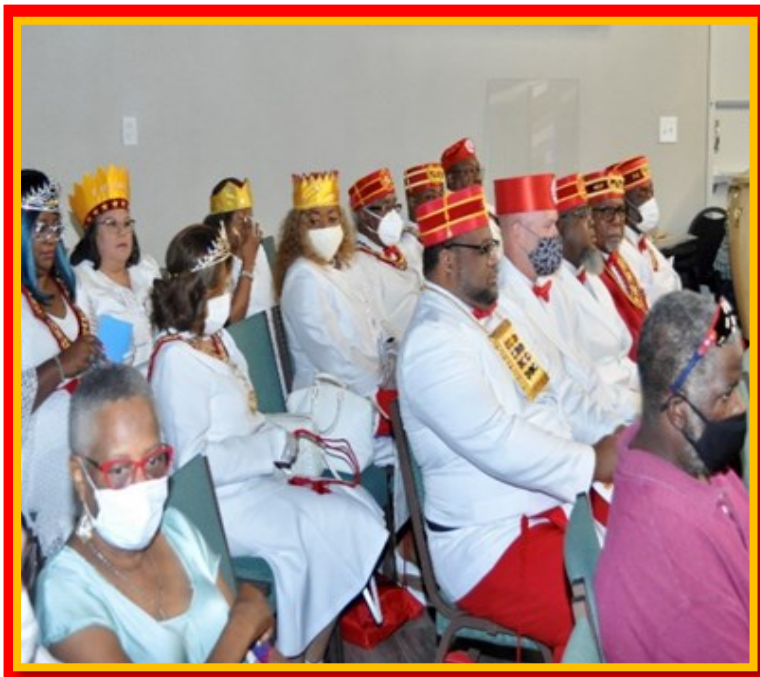
Companions and Heroines seated in preparation for today's Worship Service.